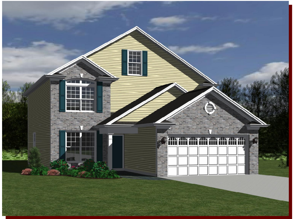
Layouts, finishes, & prices subject to change